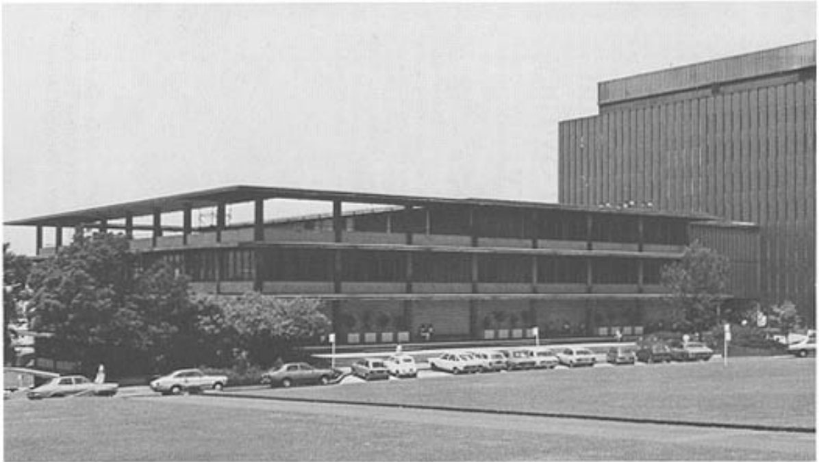
The present Fisher Library, opened 1963.

Photograph facing page 33: The present Fisher Library, opened 1963.